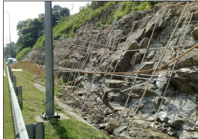
Project : Proposed Remedial Works For Rock Slope At West Bound, Section C4, JalanDamansara Toll - NKVE - Guniting Works