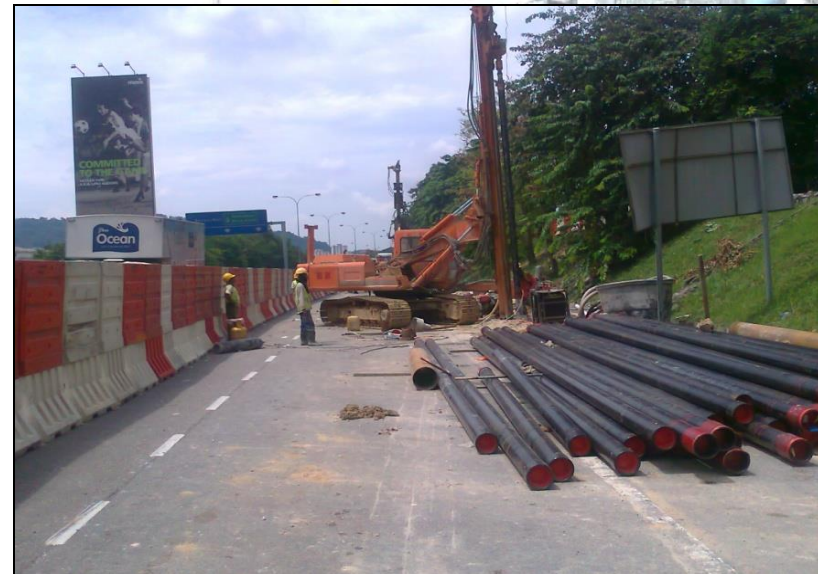
Project : Project Penyuraina Lalulintas Di Persimpangan Bertingkat Pandan Indah, MRR II, Kuala Lumpur - Micropiling Works