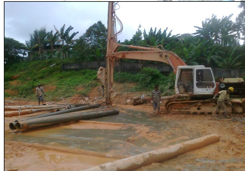
Project : Pusat Pertahanan Awam, Kuantan, Pahang - Micropiling Works