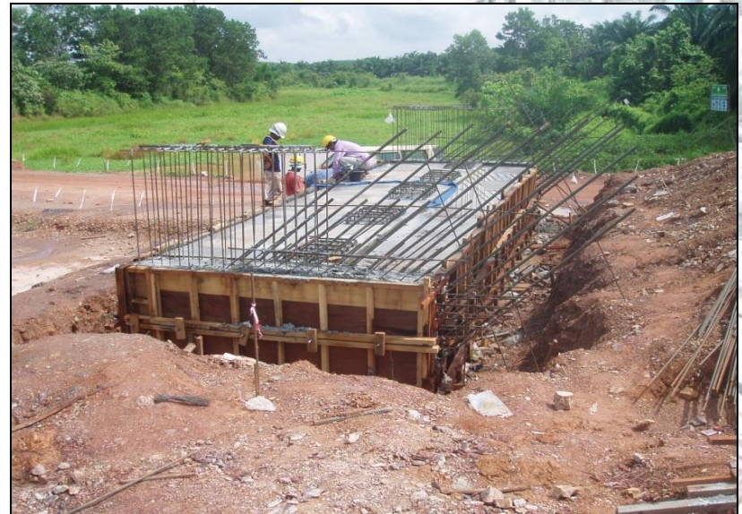
Project : Kolej Pertanian Malaysia (KPM), Bukit Tangga, Kedah Darul Aman - Bridge Structure Works