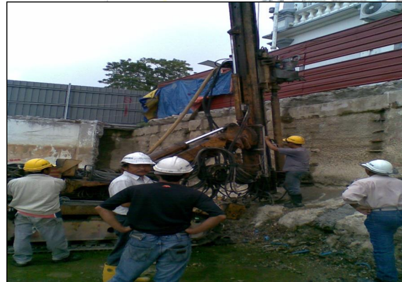
Project : Plaza Merdeka Kuching Commercial Complex / Hotel, At Pearl Street, Kuching, Sarawak - Micropiling Works