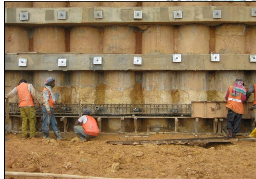
Project : Electrified Double Track Project Between Seremban & Gemas - Soil Nail Concrete Grid Beam At CBP Wall