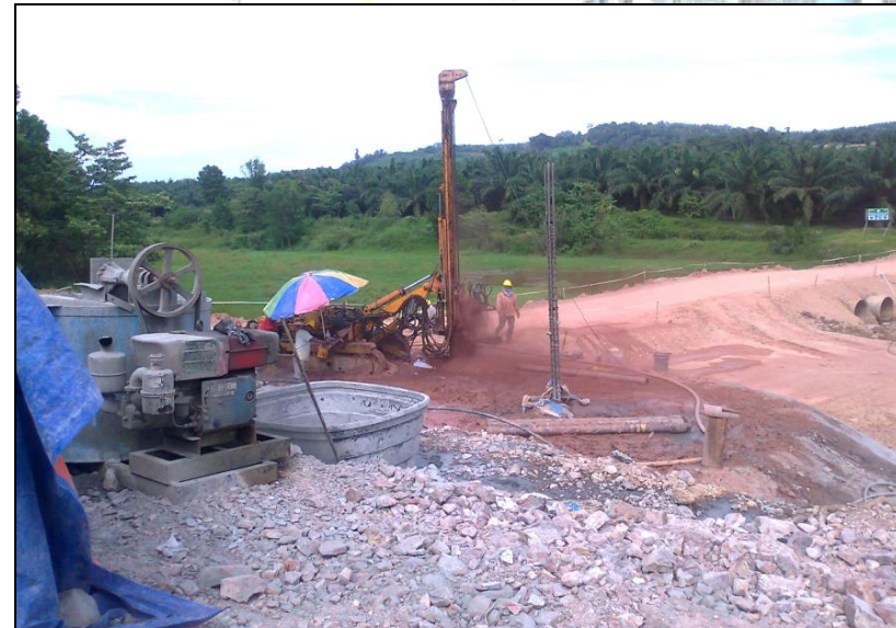
Project : Kolej Pertanian Malaysia (KPM), Bukit Tangga, Kedah Darul Aman - Micropiling Works